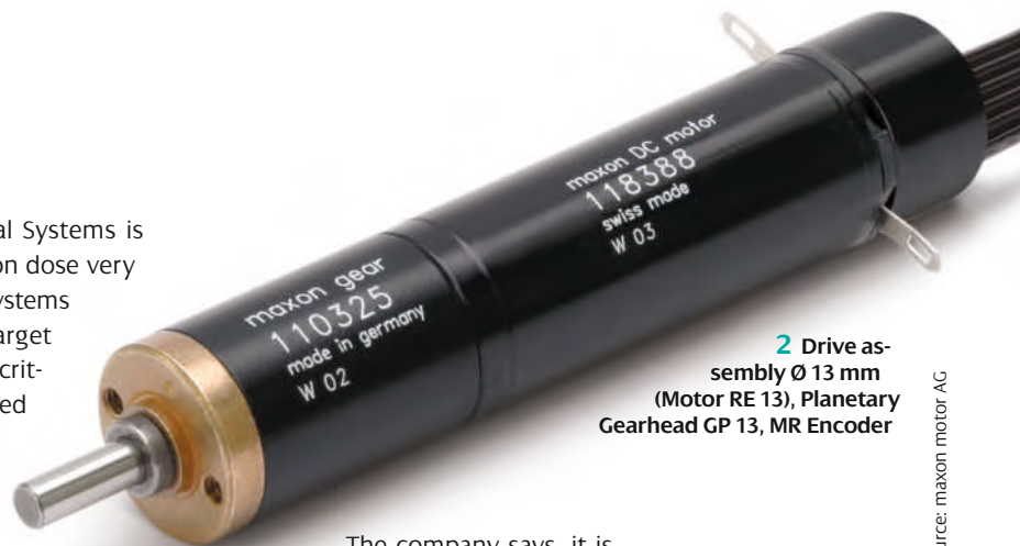
2 Drive assembly Ø 13 mm (Motor RE 13), Planetary Gearhead GP 13, MR Encoder

Prior to the new HD120 MLC multileaf collimator, Varian's finest MLC had a central group of beam-shaping leaves that were each 5 mm wide. The HD120 has reduced the width of the central leaves to just 2,5 mm, increasing the beam-shaping precision by 100 percent. Each side of the Varian collimator is configured with 60 leaves distributed in an 8 cm wide central region with 32 x 2,5 mm leaves, flanked by two 7 cm wide outer regions with 14 x 5,0 mm leaves, for a total width of 22 cm. The HD120 MLC was also designed for durability, so that it could be relied upon during continual use in a busy clinic. If the leaves are designed too tightly together, they jam. If the leaves are designed too loosely, radiation leakage occurs. Consequently, careful engineering that optimized how the leaves were packaged into the system was critical. The leaves move in and out through the use of 120 tightly packaged maxon motors.