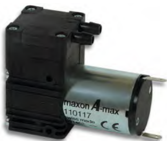
Improved by revised delivery channels and an active balancing system

Motor efficiency is up to 76percent depending on the winding. Ambient temperature range is from -20 to +65 °C. Several different windings are available to match desired speed with available voltage. Matching gearheads are also available with ratios ranging from 4:1 up to 1024:1 capable of delivering up to 200 mNm (28 oz-in) of intermittent torque. Encoders are available down to 8 mm in diameter with resolutions up to 100 lines per turn. Due to this performance and the small size, all motors are suitable for a variety of other medical applications including miniature pumps, surgical devices, air samplers, micro-stages, and laser measuring devices. ■